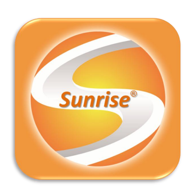
Warehouse Logistics Solutions